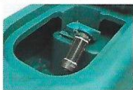
With large opening, the sewage water tank is easy to clean. The polyester material makes the tank very strong, shock-proof and anti-corrosive.