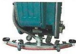
With aluminum casting squeegee, the corrosion-resistance improves greatly. The Linatex squeegee blade has excellent abrasion performance.