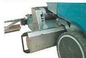
Drawer-type stainless steel garbage box, easy to load/unload and wash