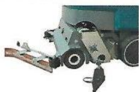
Roller brush can be replaced quickly without tool