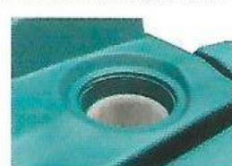
Special designed filling hole ensure easy filling of fresh water. Filter screen is available.