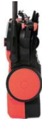
Fold storage to save space