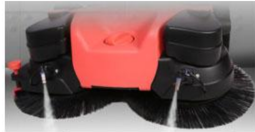
Automatic spray dust suppression Eliminate dust, meet higher cleaning need.