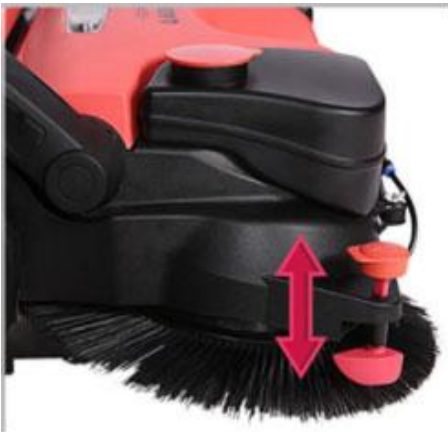
Side brush down pressure device Effectively clean dead angle.