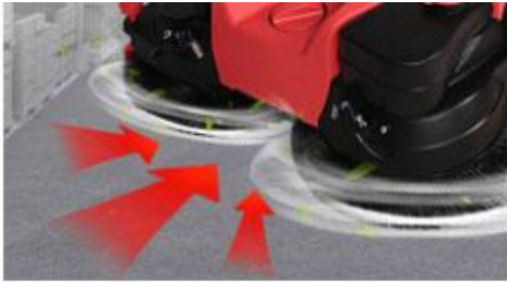
Electric drive for front and back brush Improve cleaning efficiency and save time.

Add: No. 11 Changchun Road, Zhengzhou, China; Tel: +86-371-58651986, 18339818406