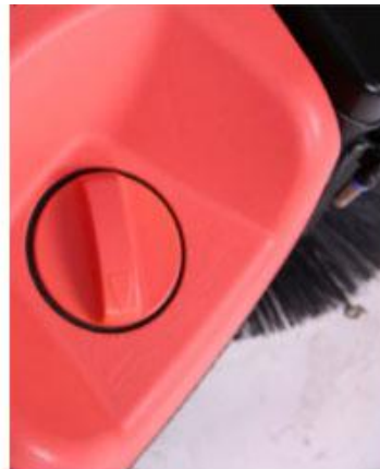
Adjustable front brush height Meet different need of ground and garbage.