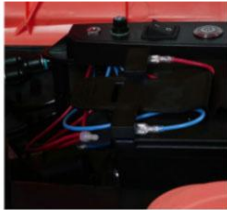
Multiple line protection Ensure safe operation in different environments.