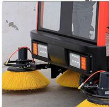
With water spray function, dust can be reduced