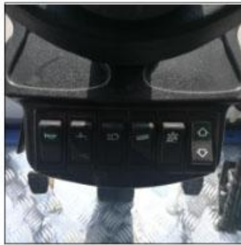
Simple operation key