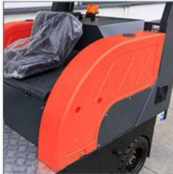
Large plastic water tank for long time work