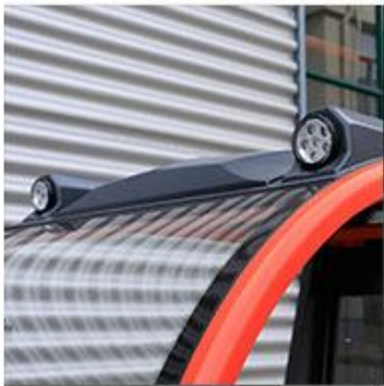
Led long spotlight for night work