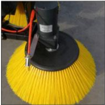
Wear resistant brush, international advanced motor automatic lifting