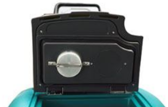
Excellent imported water absorption system, more powerful