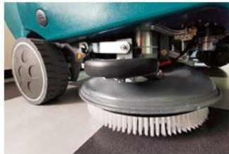
The chassis of the whole vehicle is strong, heavy, solid and durable