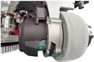
Front drive system with electronic brake, safe and reliable