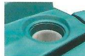
Special designed filling hole ensure easy filling of fresh water. Filter screen is available.