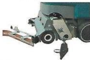
Roller brush can be replaced quickly without tool