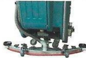
With aluminum casting squeegee, the corrosion-resistance improves greatly. The Linatex squeegee blade has excellent abrasion performance.