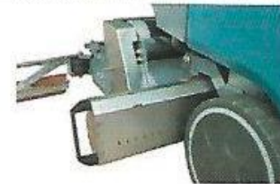
Drawer-type stainless steel garbage box, easy to load/unload and wash