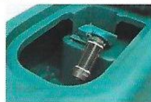
With large opening, the sewage water tank is easy to clean. The polyester material makes the tank very strong, shock-proof and anti-corrosive.